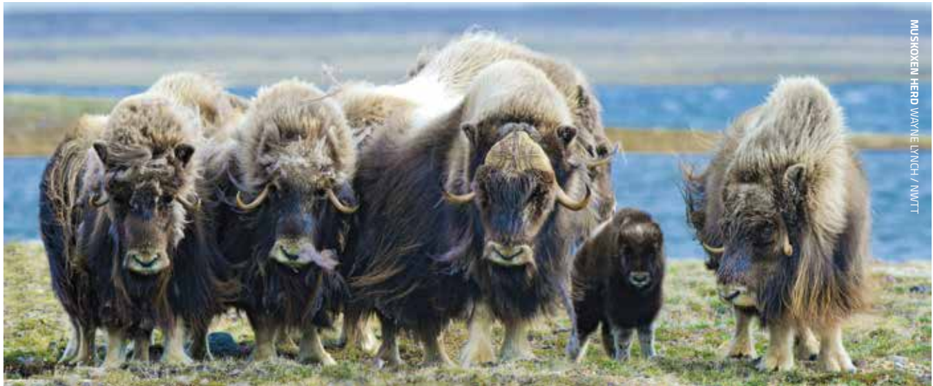
MUSKOXEN HERD

For more information about NWTT's marketing plans, head to the resources section on the Members Website members.spectacularnwt.com