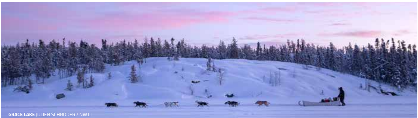
GRACE LAKE JULIEN SCHRODER / NWTT