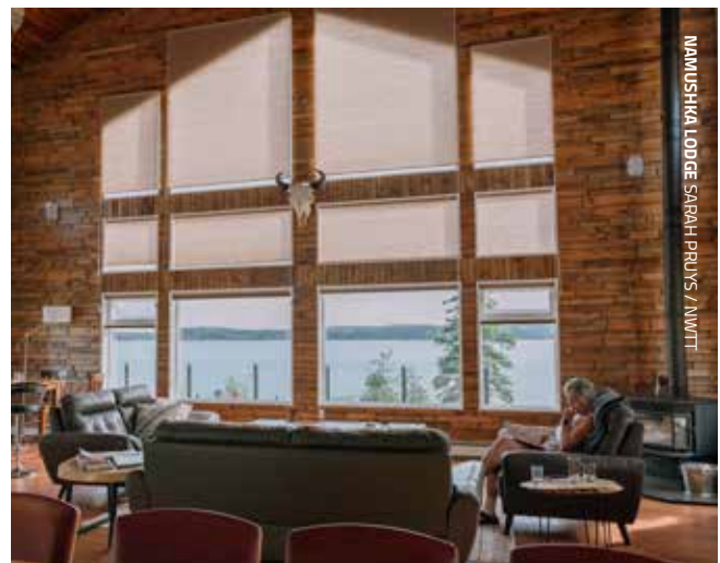
NAMUSHKA LODGE